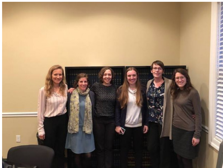
Ayuda attorneys at the immigration clinic on Maryland's Eastern Shore

Many clients we met with during the consultations were surprised that they could in fact continue to receive public benefits and were likely eligible to apply for a visa based on surviving domestic violence. It was a powerful experience for Ayuda attorneys to provide the proper information and watch the client's eyes light up as they considered a brighter future.